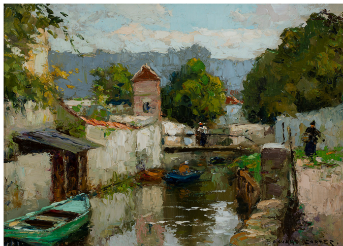
Edouard Cortes Le Canal