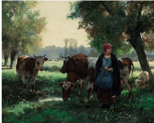
Julien Dupre A Bord de la Mare