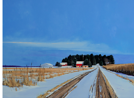
Ben Bauer County Road 4 Farmstead