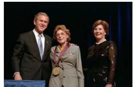
Helen Frankenthaler receiving the National Medal of Arts

Many prominent twentieth-century artists wanted to ensure that the success they earned through lifetimes could go on to support other artists in the future. That is why many foundations and other groups named after such artists are set up with the artists' money to provide education and funding to ensure their legacy lives on. These foundations also tend to be the authorities on the work of their namesakes, editing and publishing the artist's catalogue raisonné and authenticating newly-discovered works. Of course, protecting an artist's legacy can be difficult work, which is why some foundations sometimes find themselves in legal trouble. Previously, I've written about the Andy Warhol Foundation and their efforts to defend their licensing of a Warhol print that used a photographer's work as its basis . I've also covered the Joan Mitchell Foundation and its spat with Louis Vuitton . Now, a lawsuit is being brought against a different foundation, the Helen Frankenthaler Foundation. Its former president is suing over his improper dismissal and launching some pretty interesting accusations at the current board members.