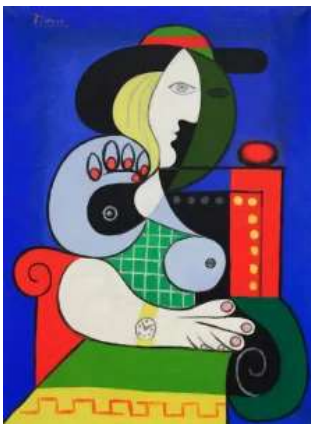
Femme à la montre by Pablo Picasso