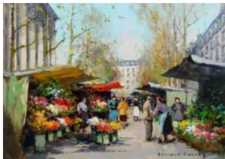
Flower Market Madeleine by Edouard Cortès