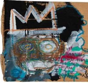
Untitled (Self-Portrait or Crown Face II) , one of the Basquiat forgeries seized from the Orlando Museum of Art