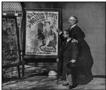
Henri de Toulouse-Lautrec standing with poster designer Jules Chéret

Henri de Toulouse-Lautrec is often considered one of the most prolific post-impressionist artists alongside Van Gogh and Gauguin. He is best known for chronicling daily life in Paris, specifically its nightlife. He frequently visited the cafés , cabarets , and dance halls in the city, creating paintings and prints of their patrons and the performers, sometimes as advertisements on behalf of the venues . Toulouse-Lautrec was noticeably short, the result of several things converging at once. He came from an aristocratic family in southern France, with his father being a Count. Being aristocrats, his parents were first cousins, so right off the bat, not looking good. His parents' close relation may have led to him having an unknown disorder that many say was likely pycnodysostosis. This condition often results in either abnormally dense bones or incredibly brittle bones. His condition affected him greatly after he broke both of his femurs in separate incidents about a year apart. The bones could not heal properly and