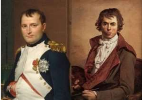
The Emperor Napoleon in His Study at the Tuileries by Jacques-Louis David (detail, left); Self-Portrait by Jacques-Louis David (right)

The relationship between Jacques-Louis David and Napoleon Bonaparte is an incredibly interesting one. Napoleon was already known for his military campaigns in Italy when he met the neoclassicist painter. Meanwhile, David's reputation needed some rehabilitation at the time since, on top of being a well-known artist, he was a political revolutionary who served as a member of the Committee of General Security. This body, along with the Committee of Public Safety, were the two groups that organized and carried out the Reign of Terror, resulting in thousands of people being executed by the guillotine.