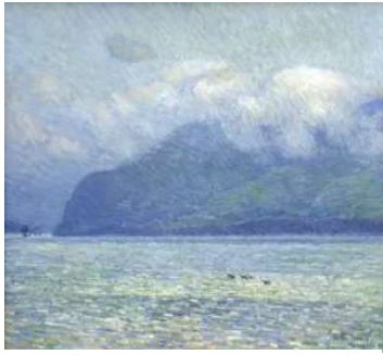
The Silver Veil and the Golden Gate by Childe Hassam