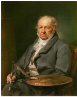
Francisco de Goya by Vicente López Portaño

Francisco de Goya is considered one of the greatest, most influential Spanish painters ever. Known primarily for his work in the service of the Spanish royal family , he is also known for his work showing scenes from the Peninsular War , when Napoleon's armies invaded Spain. However, he is also known for his darker, more fantastical scenes from his later life. In the 1790s, Goya began experiencing chronic headaches, dizziness, loss of mobility in his right arm, and issues with his hearing. He began to lose weight, he grew depressed, and sometimes he would experience hallucinations. Some believe that these symptoms were the result of several contributing factors, including syphilis, which Goya treated using mercury. Furthermore, the paints he used often contained lead, which I'm sure didn't exactly help. This culminated in his best-known work from his later life: the Black Paintings. These were a series of murals painted on the walls inside his house just outside of Madrid. They are dark, mysterious works, often dealing with subjects like fear, evil, darkness, violence, and monsters.