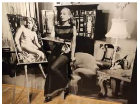
Tamara de Lempicka, shown in her studio as part of a museum display

Musical theater can take many forms, but a biographical story can often prove successful, depending on the subject. Shows like Evita , Gypsy , and Six have all gained incredible success and recognition for telling the stories of real people. However, an incredibly successful musical biography about an artist is not something that we've gotten. Perhaps the closest we've seen is Sunday in the Park with George , which looks at Georges Seurat and his creation of Sunday Afternoon on the Island of La Grande Jatte . Because it's by Stephen Sondheim, Sunday in the Park with George is known among theater nerds but might not be an instantly recognizable household name. But next year, we might get a new, successful musical all about an artist.