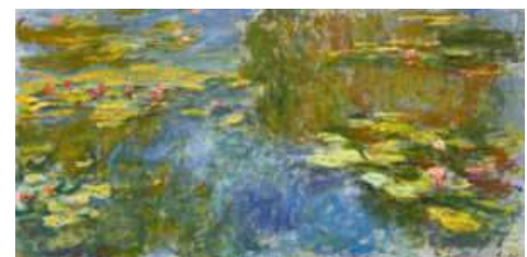
Le bassin aux nymphéas by Claude Monet