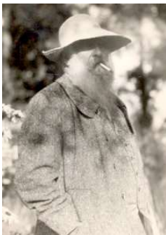
Claude Monet and his floppy hat

When I often try to explain what Impressionism was, I tend to break it down and simplify it as "They made stuff blurry." Of course, it's more complicated, but this form of abstraction came about because these painters wanted to create their works en plein air as quickly as possible to capture a specific moment. Being a founding member of the Impressionist group, Claude Monet's works are often held up as quintessential examples of the style. His early Impressionist works from the 1870s, like Impression, soleil levant and Woman with a Parasol , made a great impact on generations of painters. Yet when you say the name Monet to a random person, chances are they'll only think of one thing: the water lilies of his later career.