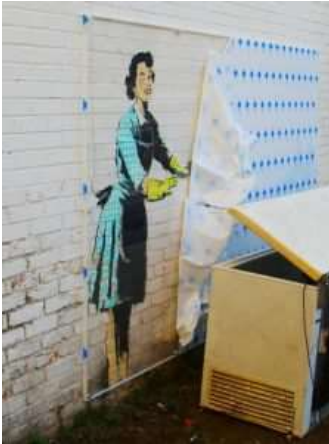
Valentine's Day Mascara by Banksy, partially covered